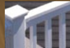
Tam-Rail® Railing System