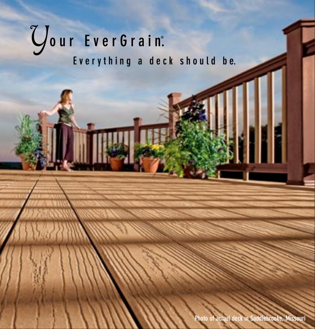
Photo of actual deck in Saddlebrooke, Missouri

Your EverGrain. ® Everything a deck should be.