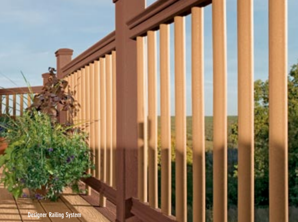
Designer Railing System