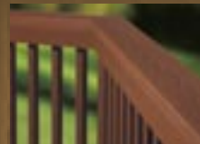
Traditional Railing System